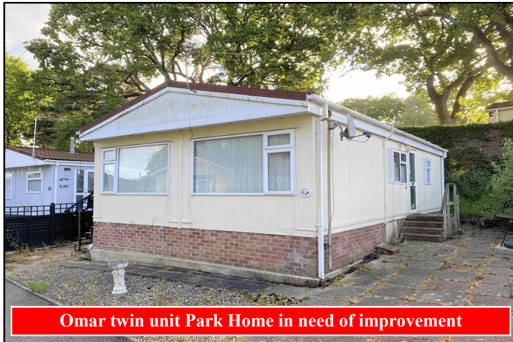
Omar twin unit Park Home in need of improvement

28 Doveshill Park, Barnes Road, Ensbury Park, Bournemouth. BH10 5AJ